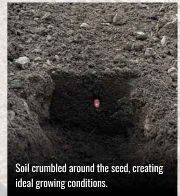
Soil crumbled around the seed, creating ideal growing conditions.