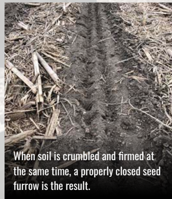
When soil is crumbled and firmed at the same time, a properly closed seed furrow is the result.