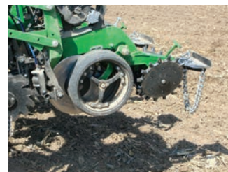
The Twister's rounded center ring maintains consistent depth.