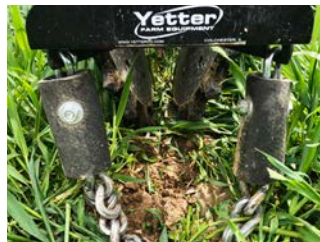
The Twister performs in varying soil conditions, cover crops, and tillage practices.