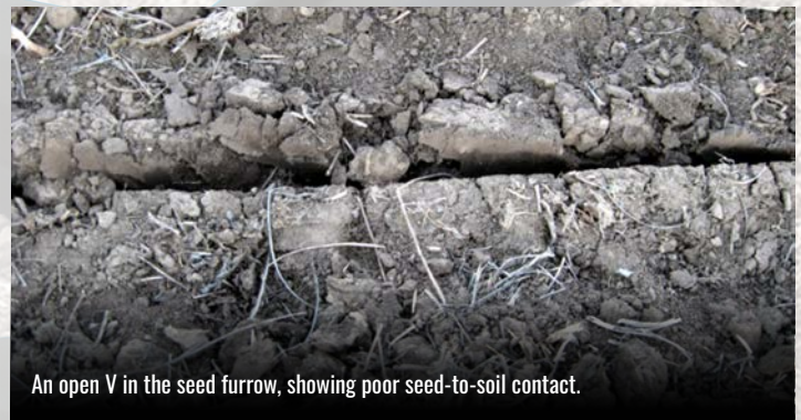
An open V in the seed furrow, showing poor seed-to-soil contact.

With the Twister Closing Wheel, the seed furrow is closed, giving you assurance that the investment you made in seed, chemical, fertilizer, and equipment will produce the yields you have planned for.