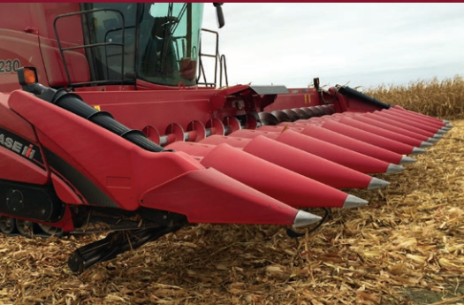
CASE IH 4412