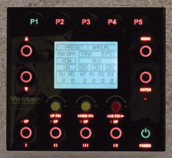
In-Cab Controller Screen