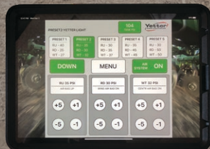
Wi-Fi controls for tablet or iPad