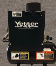
HYDRAULIC PNEUMATIC COMPRESSOR KIT