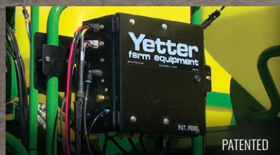
PNEUMATIC HYDRAULIC CONTROLLER KIT