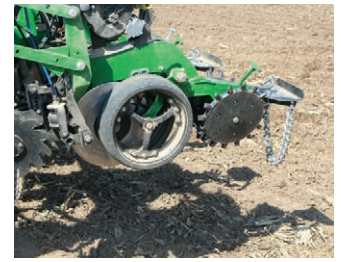
The Twister's rounded center ring maintains consistent depth.