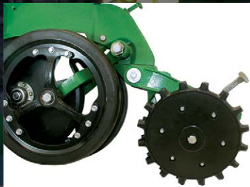
NEW: 6200-007 Twister Short Poly Closing Wheel