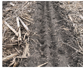
The Twister's spikes crumble and firm soil at the same time.

Cost-effective and easy to install: The Twister Poly Closing Wheel is built for durability with ultra-high molecular weight (UHMW) plastic. It takes as little as five minutes per row unit to install. Independent studies by Beck's Practical Farm Research have shown the Twister provides a positive return on investment.