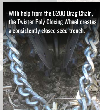
With help from the 6200 Drag Chain, the Twister Poly Closing Wheel creates a consistently closed seed trench.