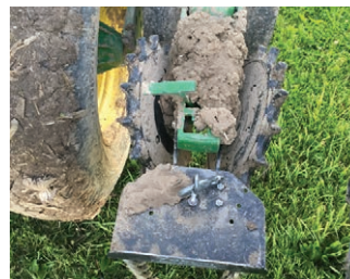
The Twister's rounded center design prevents mud buildup.