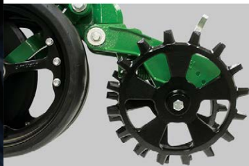
NEW: 6200-009 Twister Cast Closing Wheel