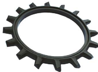
6200-006 Ring-Only Insert

Also available: 6200-008 Short Ring-Only Insert