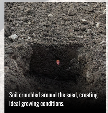
Soil crumbled around the seed, creating ideal growing conditions.