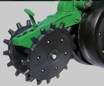
6200-005 Twister Poly Closing Wheel