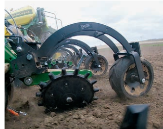
The Twister performs in varying soil conditions, cover crops, and tillage practices.