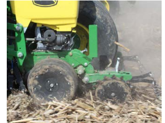
The Twister fractures the sidewall as it rolls through the field.