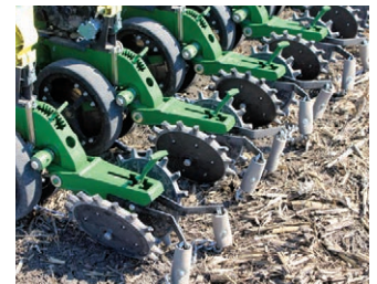
A Twister Closing Wheel can be installed in as little as five minutes.