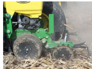
The Twister fractures the sidewall as it rolls through the field.