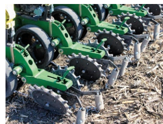
A Twister Closing Wheel can be installed in as little as five minutes.