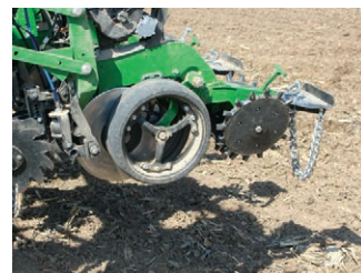
The Twister's rounded center ring maintains consistent depth.