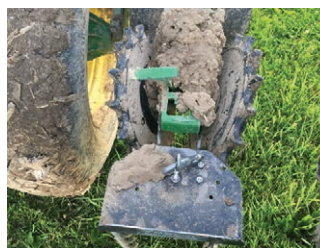
The Twister's rounded center design prevents mud buildup.