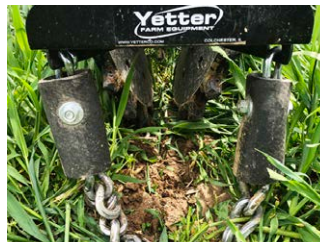
The Twister performs in varying soil conditions, cover crops, and tillage practices.