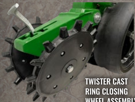
TWISTER CAST RING CLOSING WHEEL ASSEMBLY