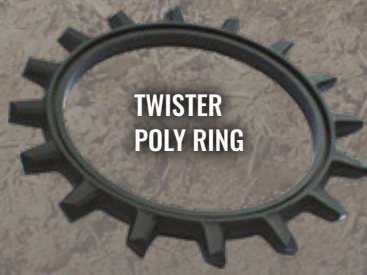
TWISTER POLY RING