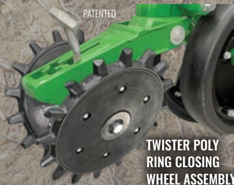
TWISTER POLY RING CLOSING WHEEL ASSEMBLY