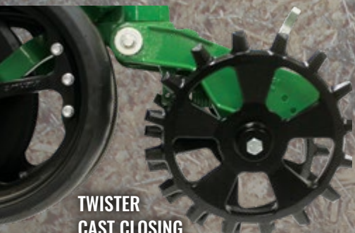
TWISTER CAST CLOSING WHEEL ASSEMBLY

With weather and field conditions changing every year, 6200 Twister Closing Wheels are a key component for even emergence.