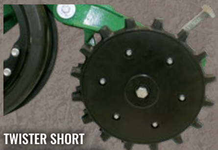
TWISTER SHORT POLY RING CLOSING WHEEL ASSEMBLY