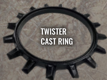
TWISTER CAST RING