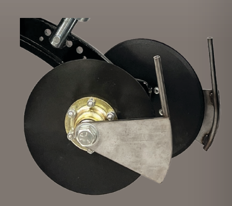
OPTIONAL LIQUID FERTILIZER KIT