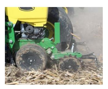
The Twister fractures the sidewall as it rolls through the field.