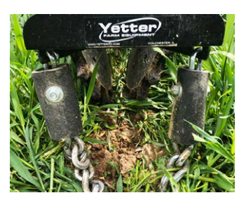
The Twister performs in varying soil conditions, cover crops, and tillage practices.