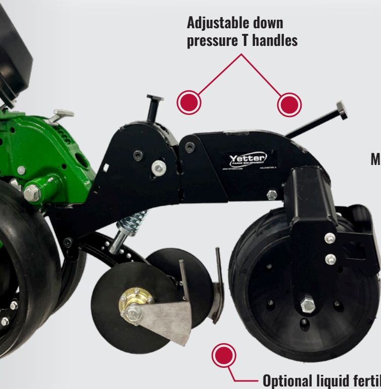
Adjustable down pressure T handles