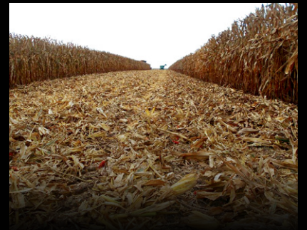
A Devastated harvested corn pass.