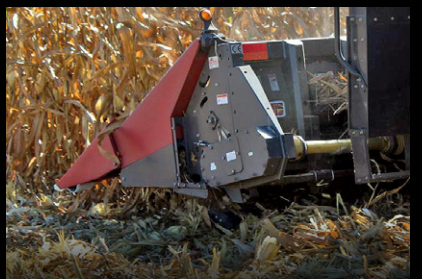
The Devastator knocks over residue for combine tires or tracks and tires on any equipment that follows.