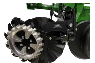
2940 Coulter/Row Cleaner Combo