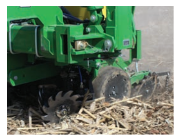
Creating a smooth ride for gauge wheels, reducing planter bounce