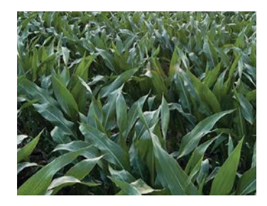
Delivering ROI through better crop stands and higher yields

LOOKING FOR TIPS ON SETTING AND ADJUSTING YOUR ROW CLEANERS?