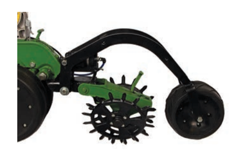
2940 Firming Wheel