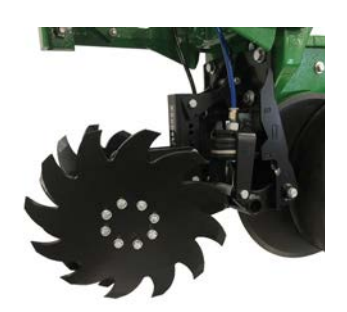
2940 Firming Wheel