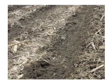
Moving residue out of the row without engaging too much soil

Row cleaners top the list when it comes to planter upgrades. Properly set row cleaners improve planter performance and seed emergence by: