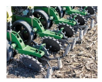
A Twister Closing Wheel can be installed in as little as five minutes.