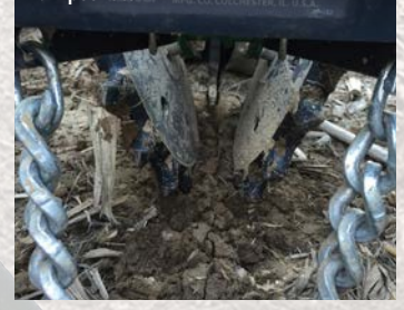
The Twister crumbles soil to break up sidewall compaction and eliminate air pockets.