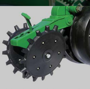
6200-005 Twister Poly Closing Wheel