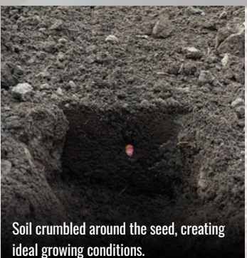
the Twister Poly Closing Wheel creates a consistently closed seed trench.