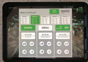
Wi-Fi controls for tablet or iPad