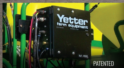
PNEUMATIC HYDRAULIC CONTROLLER KIT