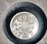
LT 235/65 R-16