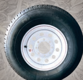
ST 235/80 R-16