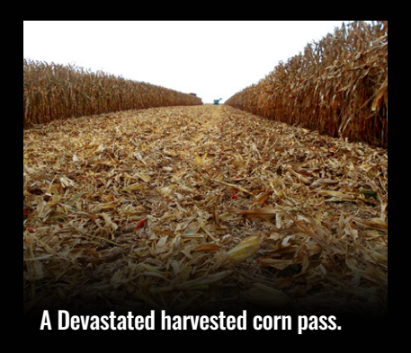
On the left, cornstalks stand before being crimped by the Devastator. Under the head, stalks are knocked over to touch the ground.