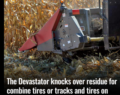
any equipment that follows.