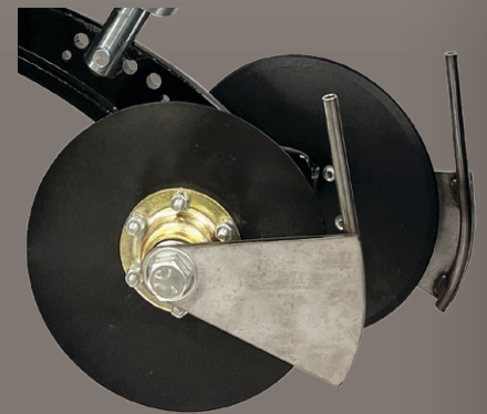
OPTIONAL LIQUID FERTILIZER KIT

Available with smooth or serrated closing disc options.