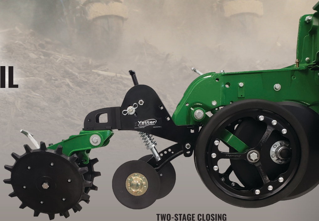
TWO-STAGE CLOSING SYSTEM WITH V CLOSING WHEELS

Available with smooth or serrated closing disc options.