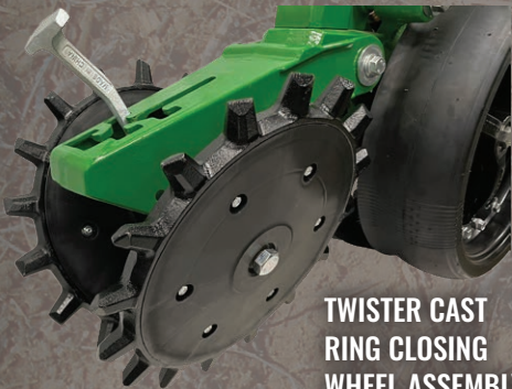
TWISTER CAST RING CLOSING WHEEL ASSEMBLY