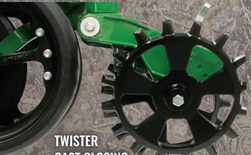
TWISTER CAST CLOSING WHEEL ASSEMBLY

With weather and field conditions changing every year, 6200 Twister Closing Wheels are a key component for even emergence.