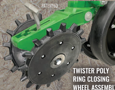
TWISTER POLY RING CLOSING WHEEL ASSEMBLY