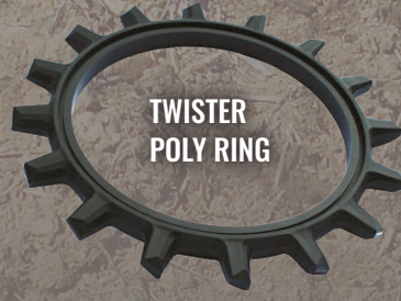
TWISTER POLY RING