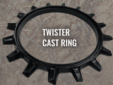
TWISTER CAST RING